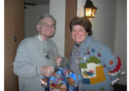
A local senior receives a Holiday Basket in December, 2009.

Additional support for RSVP provided by the State of Wisconsin Department of Health Services Division of Long Term Care and the Waukesha County Community Development Block Grants.